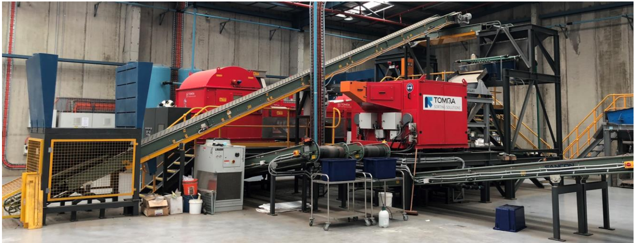
FIGURE 1 – TOMRA XRT AND EM ORE SORTER, CASTLE HILL SYDNEY

The drill core selected for testing represented intersections throughout the Woodley's Shear including intervals of hangingwall and footwall material to mimic approximate dilution percentages of development ore drives with design dimensions of 4.2mW x 4.5mH. These dimensions of access tunnel would enable the use of high productivity larger underground mining machinery.